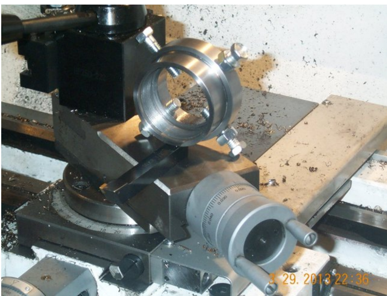
• View the full image