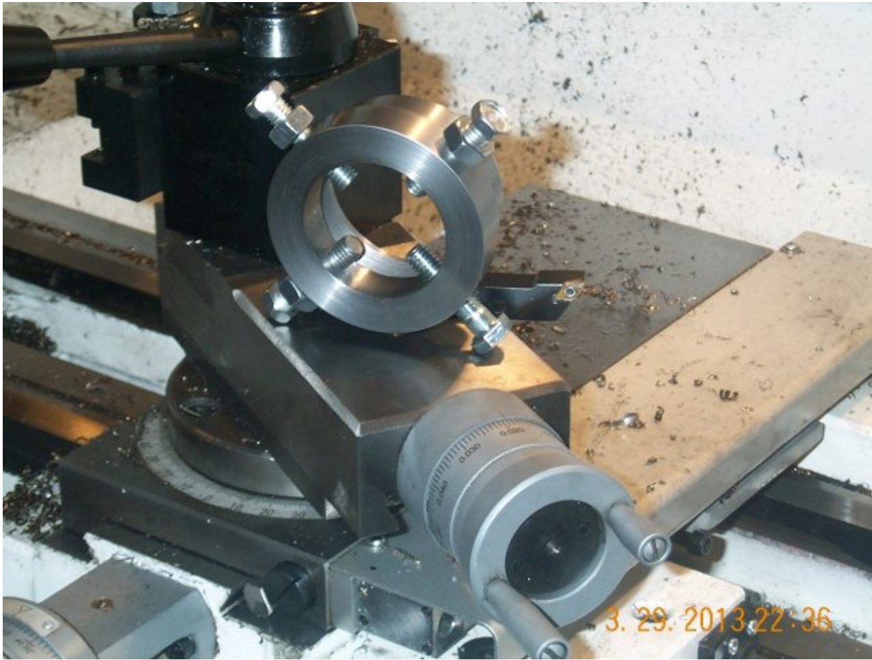
• View the full image