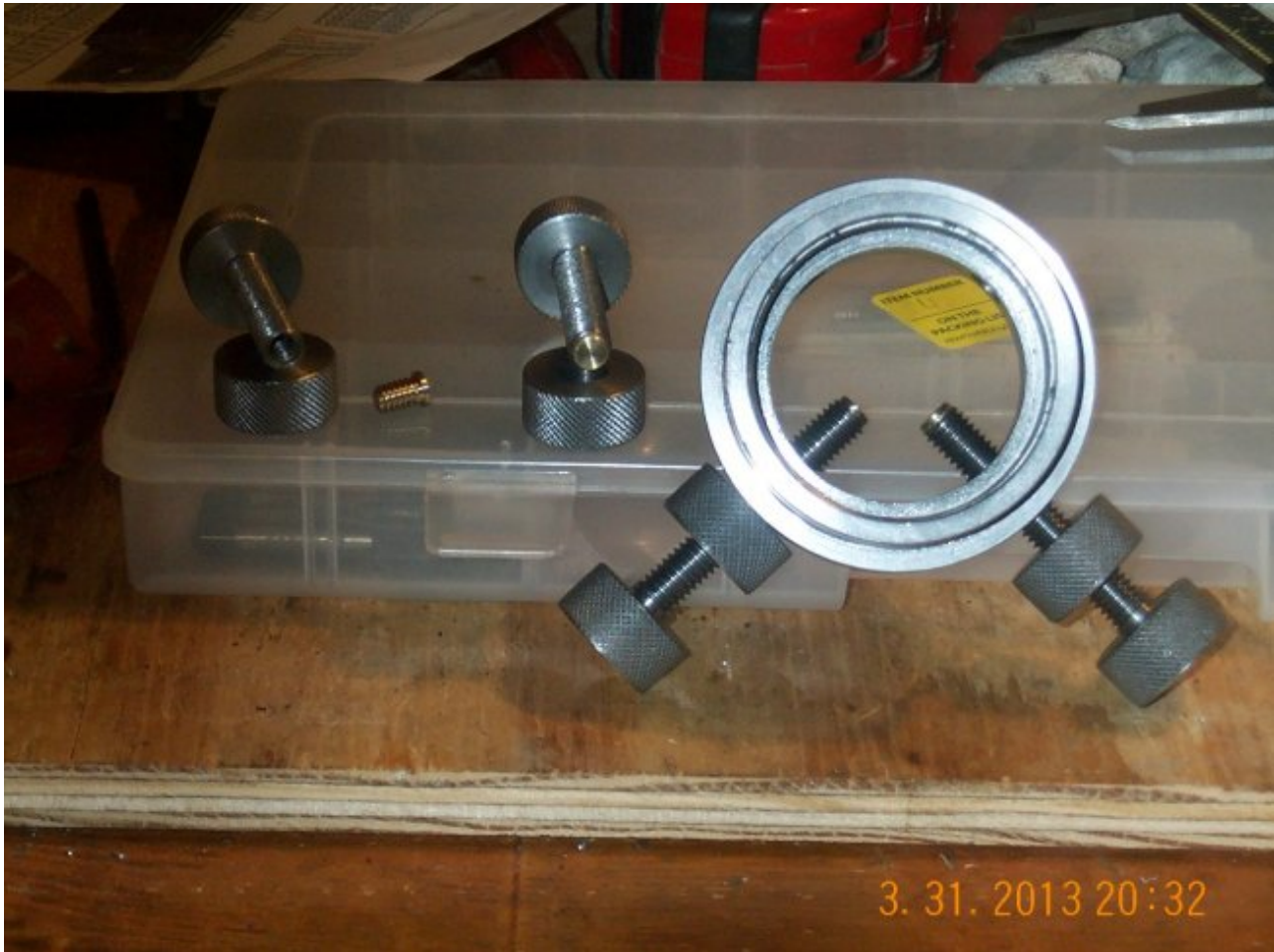
• View the full image