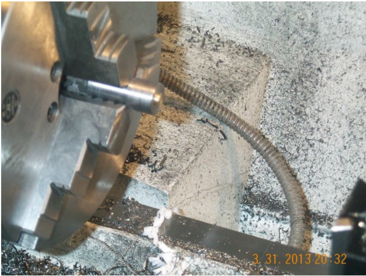
• View the full image