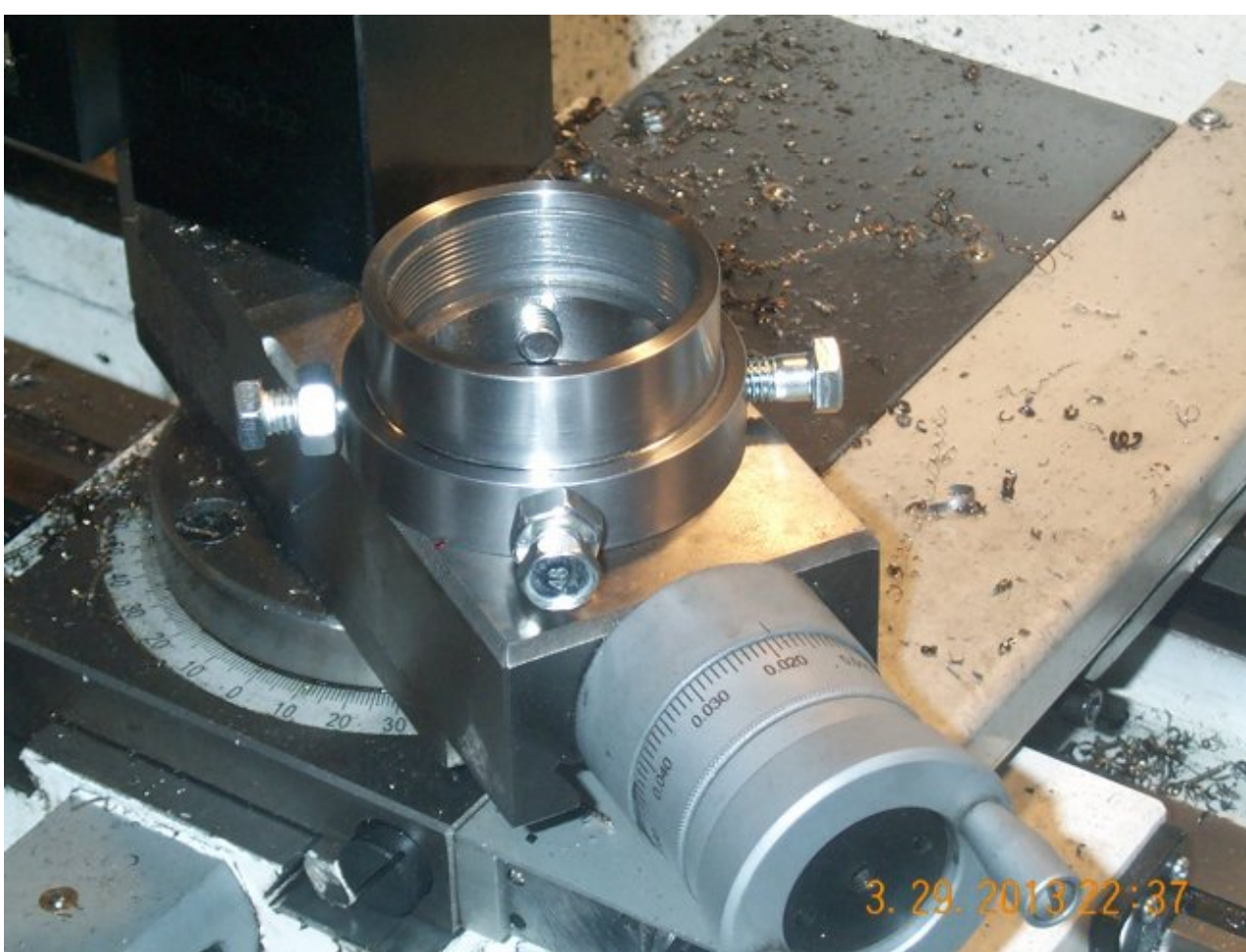
• View the full image