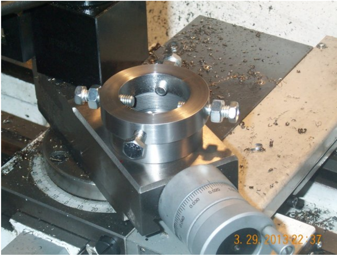
• View the full image