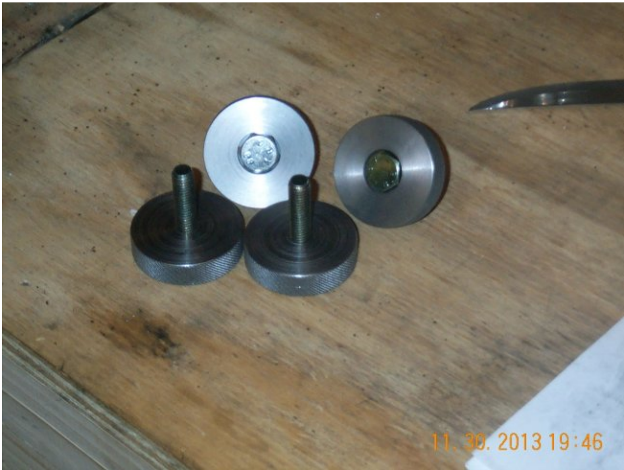
• View the full image