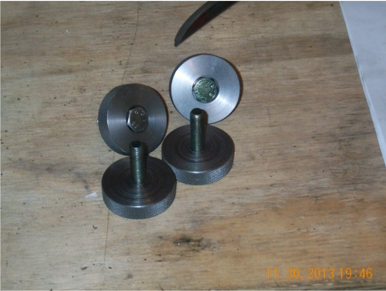
• View the full image