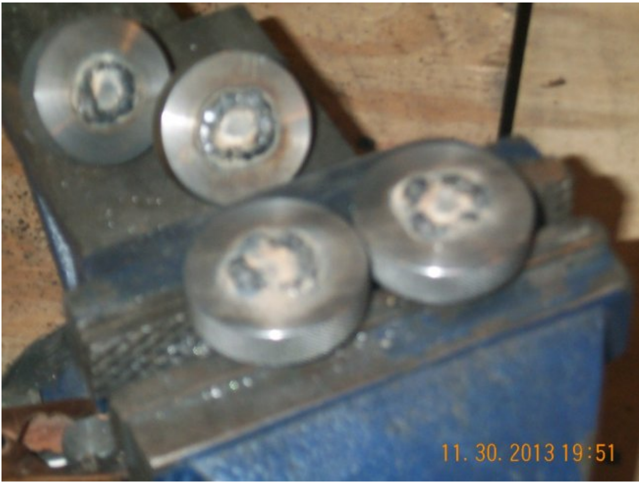
• View the full image