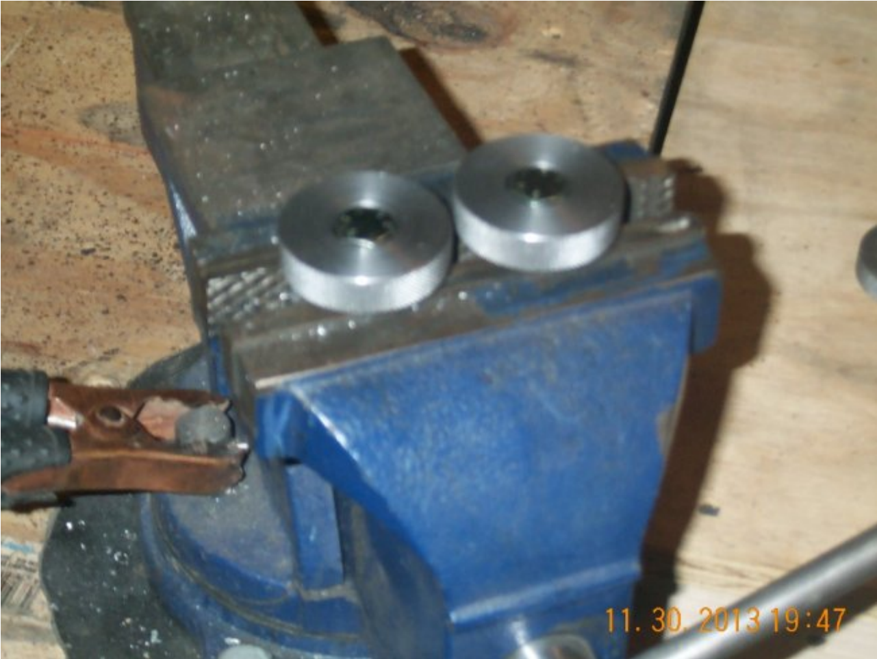
• View the full image