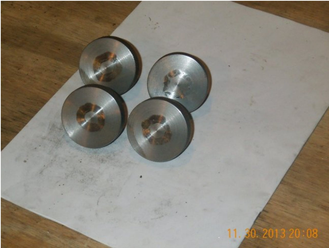
• View the full image