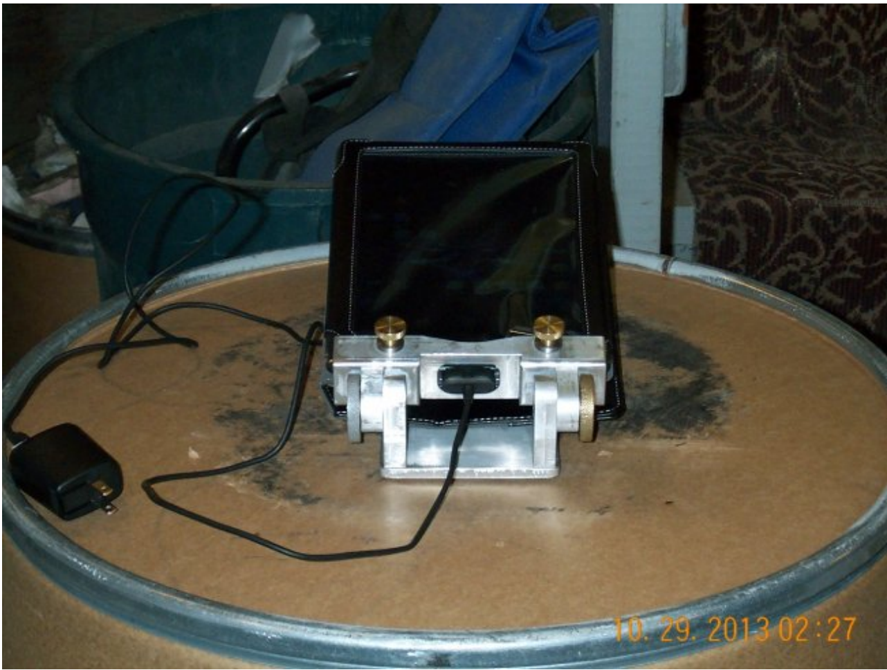
• View the full image