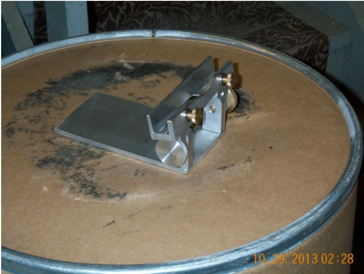
• View the full image