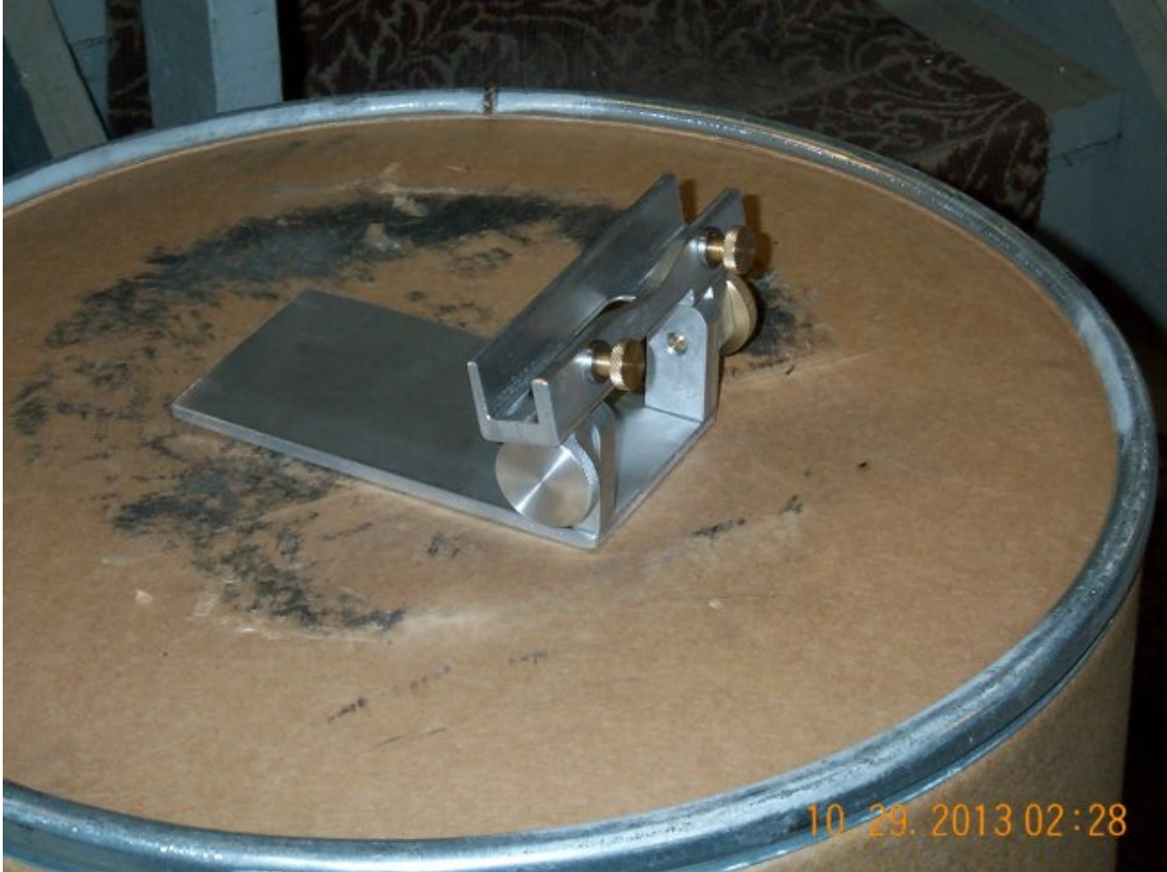
• View the full image