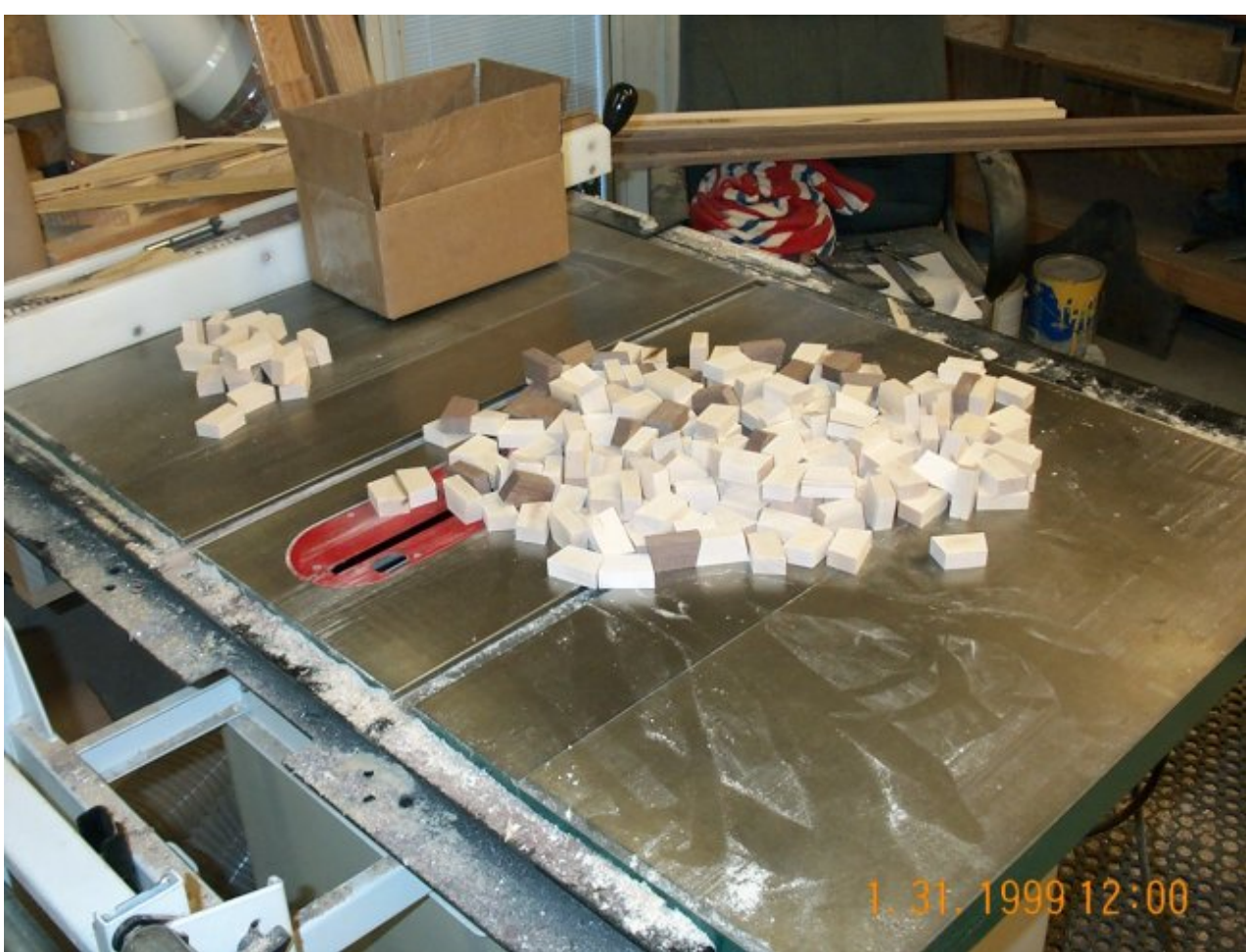
• View the full image