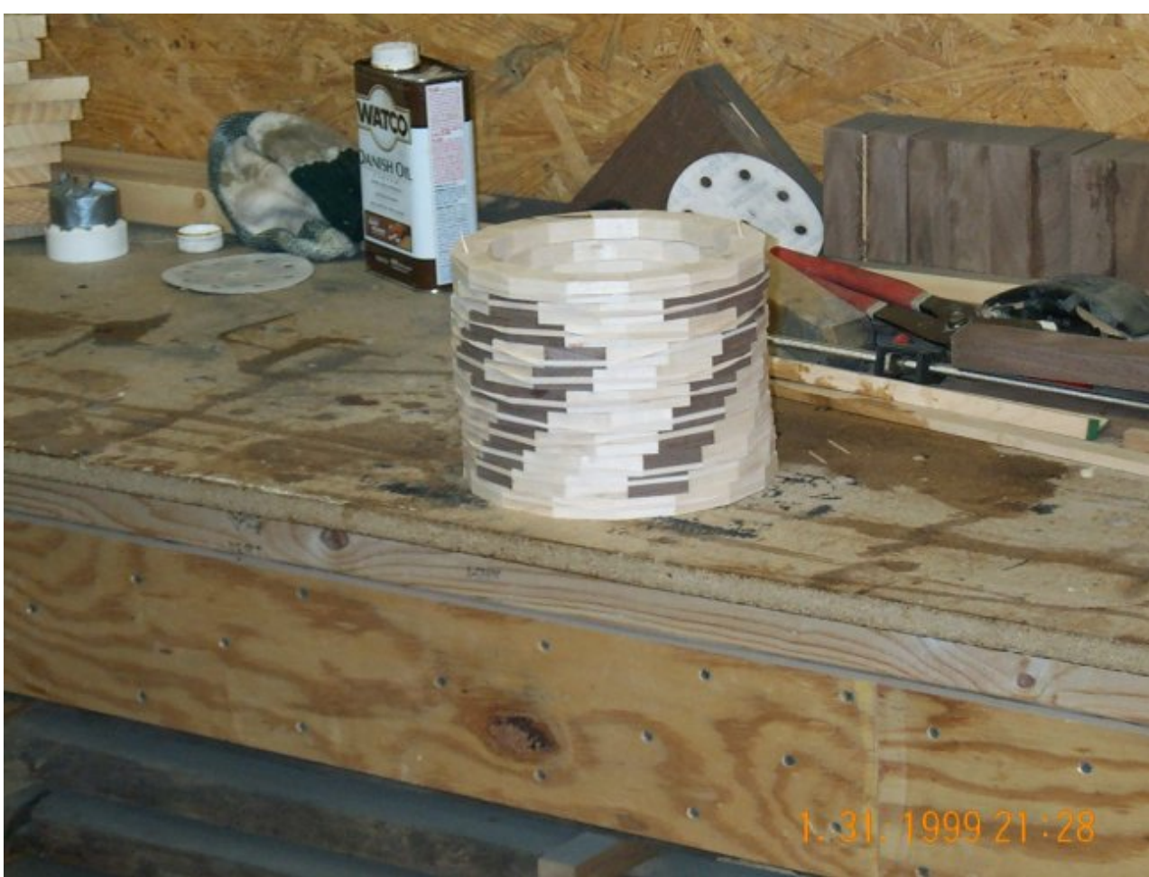
• View the full image