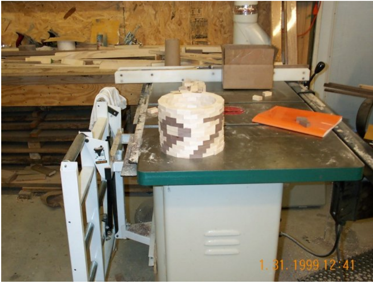
• View the full image