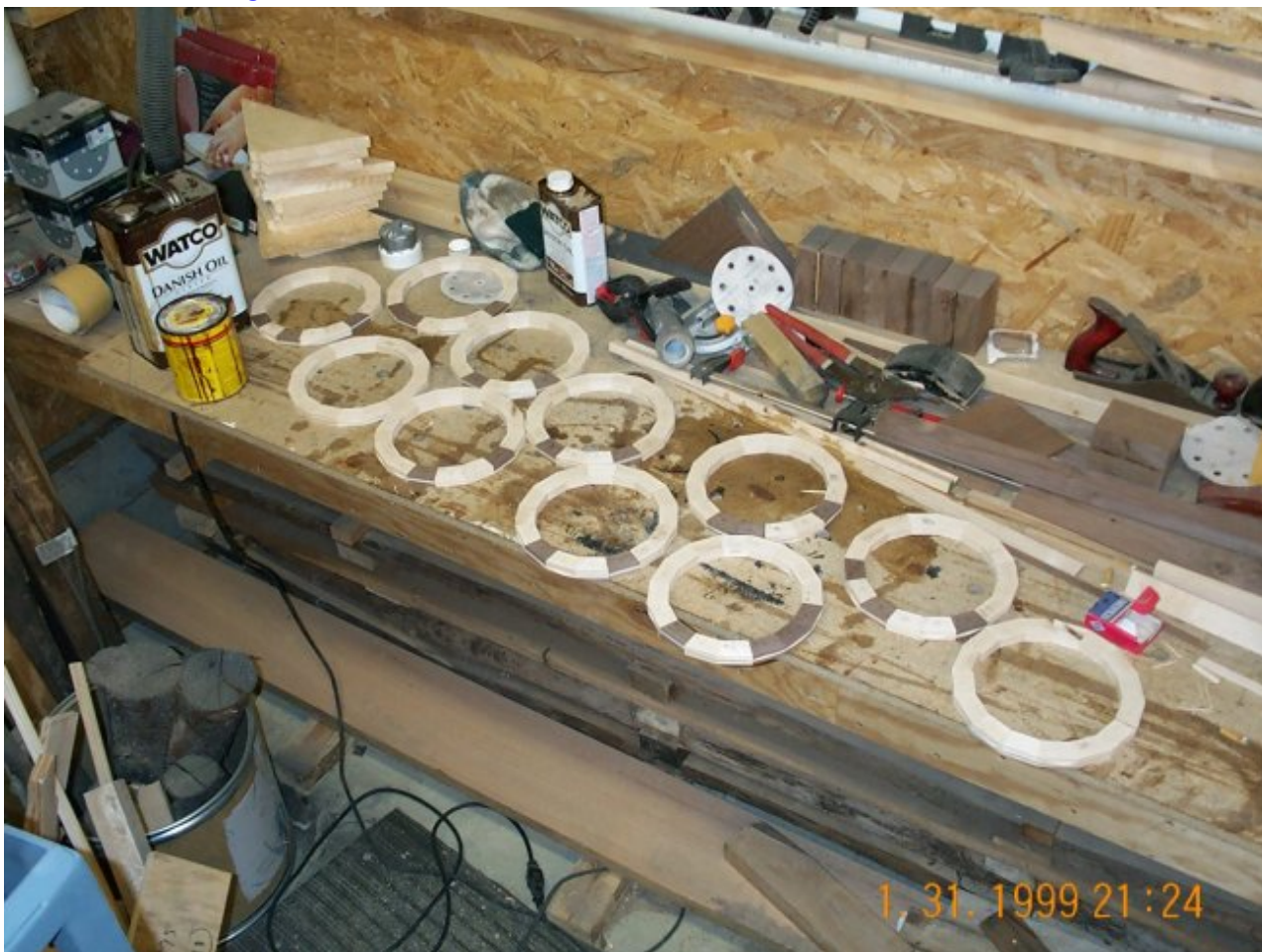
• View the full image