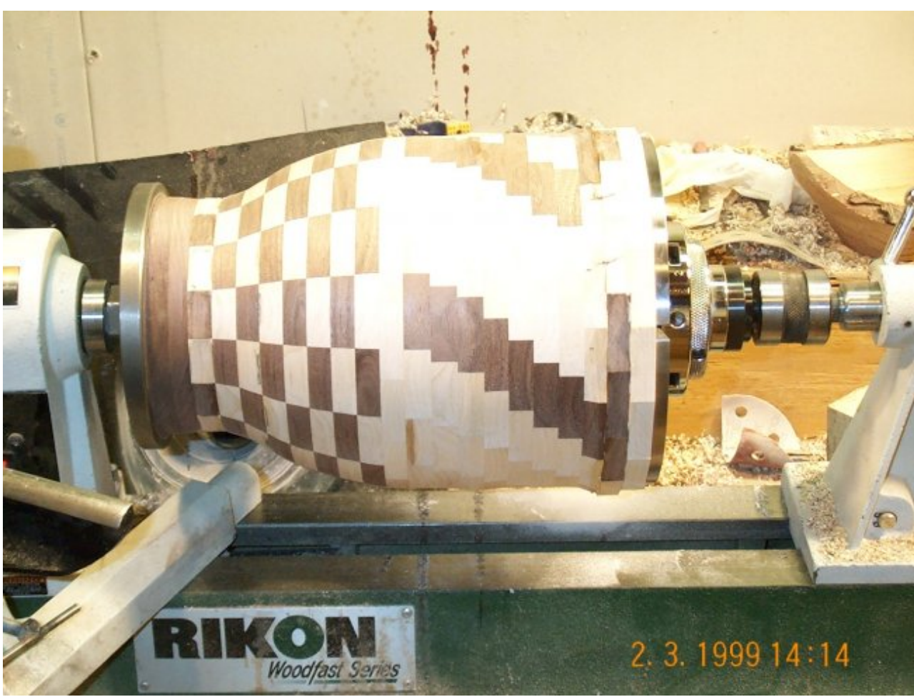
• View the full image